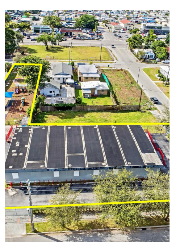
70 NE 80th Ter